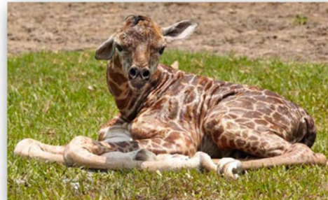
A baby giraffe joined the herd on Giraffe Ranch.